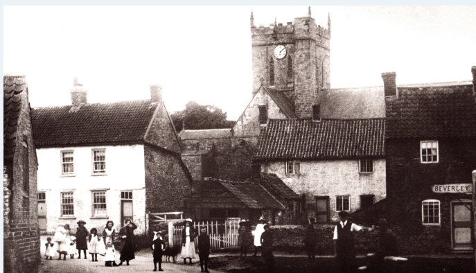
One of many historic photos of Newbald collated by organisers of Newbald Natter. This photo has been reproduced here with the kind permission of its owner.