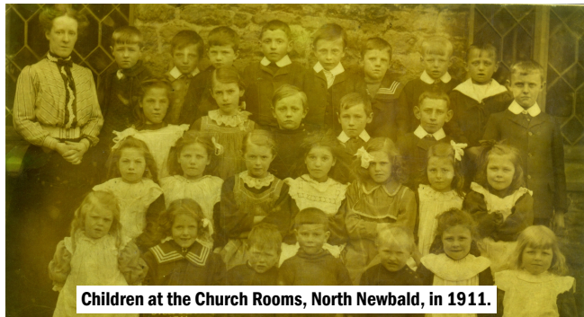
Children at the Church Rooms, North Newbald, in 1911.