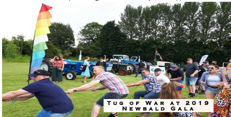
TUG OF WAR AT 2019 NEWBALD GALA

The NPFA would like to give a big thank you to everyone who attended the Gala in June – it was a fabulous day and was very successful. We really couldn't continue without the fantastic support we receive from our village and surrounding communities. We have already set a date for next year's gala – it will be held on Saturday 13th June 2020 so please save the date! Whilst on this subject, we would like to put together a list of volunteers who we could count on to help for the gala weekend. As you can appreciate, we are a